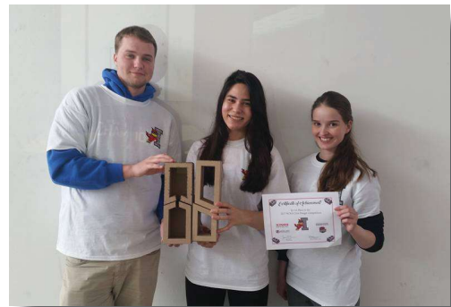
Amphi - Block: the winning unit design competition team

Click here to view the team's entry for the national competition.