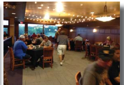
Participants enjoy a steak dinner after golf