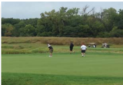
This year's golf classic was held at TCI in Polk City